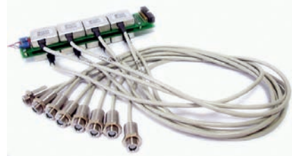
The MI unit's miniature size and low cost make it ideal for installation at multiple points along your process.