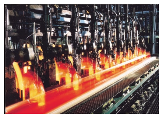
From the molten state through to the cooling process, continuous temperature monitoring ensures that glass retains its properties as it travels through the manufacturing process.