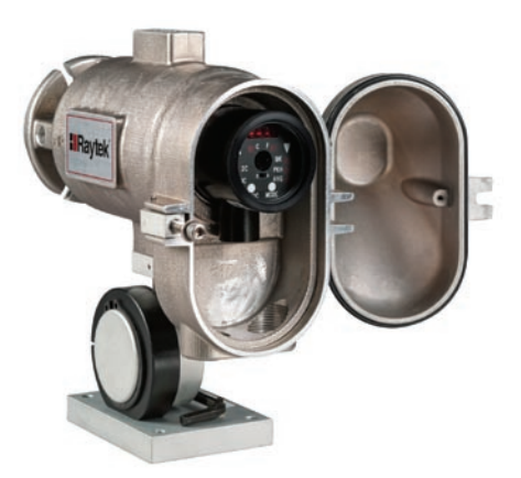
The ThermoJacket protective enclosure enables use in ambient temperatures up to 315°C (599°F).

Marathon sensors are supported by rugged accessories, like the ThermoJacket enclosure that provides environmental protection with integral water cooling and air purging. Marathon integrated sensors can be installed or removed while the ThermoJacket is in its mounted position. Additional accessories are available for customized installations.