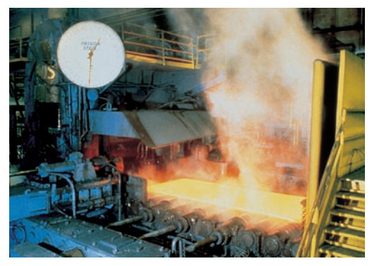
Accurately measuring temperature of slabs, billets, or blooms on a hot rolling mill ensures product uniformity.